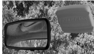
New style PIKEPASS

You'll soon be able to help Color Oklahoma in another way - with a special vehicle license tag. The new tag will cost $35 and provides additional funds to purchase seeds. You can learn more at www.coloroklahoma.org , and at www.usao.edu/~onps , the website for the Oklahoma Native Plant Society.